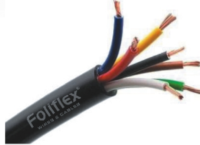
MULTI CORE ROUND