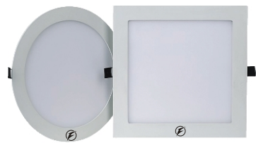
SLIM PANEL LIGHT