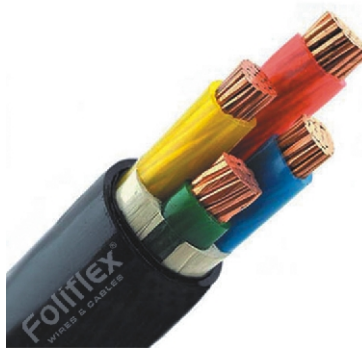
COPPER ARMoured CABLES