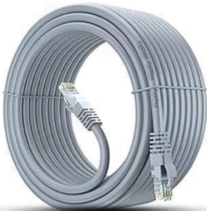
CAT 6 WIRE