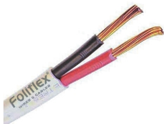
2 CORE FLAT