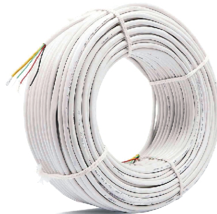
CCTV 3+1 WIRE