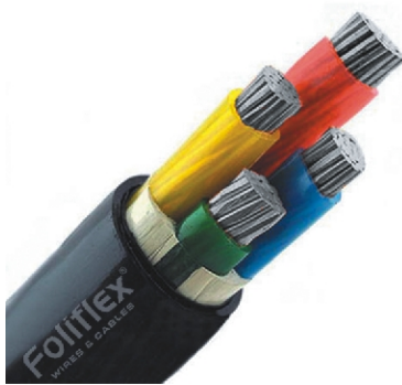
ALUMINIUM ARMoured CABLES