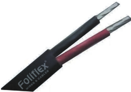
TWIN FLAT ALUMINIUM CABLE